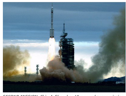
SECOND MISSION: China's Shenzhou VI manned space mission carrying two astronauts, the country's second manned space flight, lifts off from the launch pad at the Jiuquan Satellite Launch Center in Jiuquan, in China's Gansu province.

"LDRA takes this one stage further and carries out object verification testing." The LDRA tool suite is the only tool in the market which can provide both C and assembler level coverage analysis."